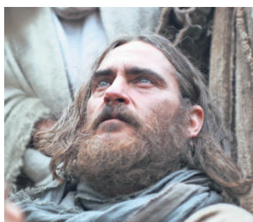
Joaquin Phoenix plays an itinerant rabbi named Jesus.

longstanding myth that she was a prostitute (a fabrication of Pope Gregory the Great in 591). And by film's end, Mary helps lead the apostles in