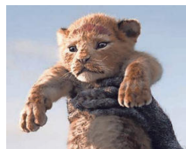
Simba squares the circle of life in "The Lion King."

King" could be one of the year's biggest films, erasing any doubts sparked by the poor