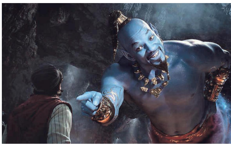
Will Smith's "Aladdin" Genie has won over fans after a disastrous rollout that caused consternation on Twitter.

"Why wasn't this the first trailer released?? Genie looks MUCH better and I'm really digging this movie now," tweeted