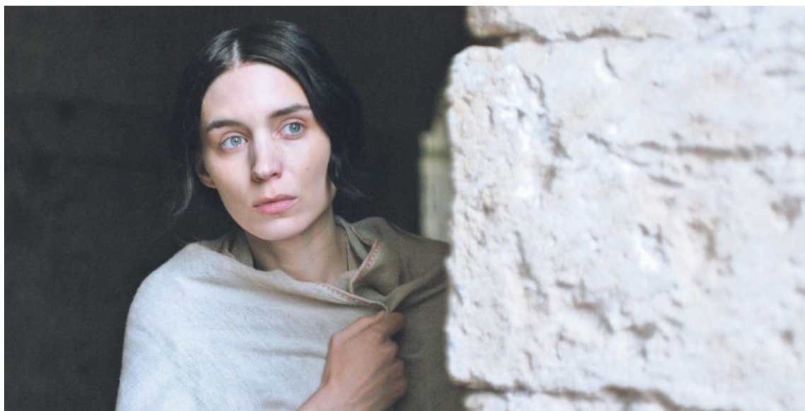
In "Mary Magdalene," Rooney Mara plays the title character not as a prostitute but a resourceful young woman from a fishing village in Judea.

But unlike past depictions of Mary, the movie rejects the