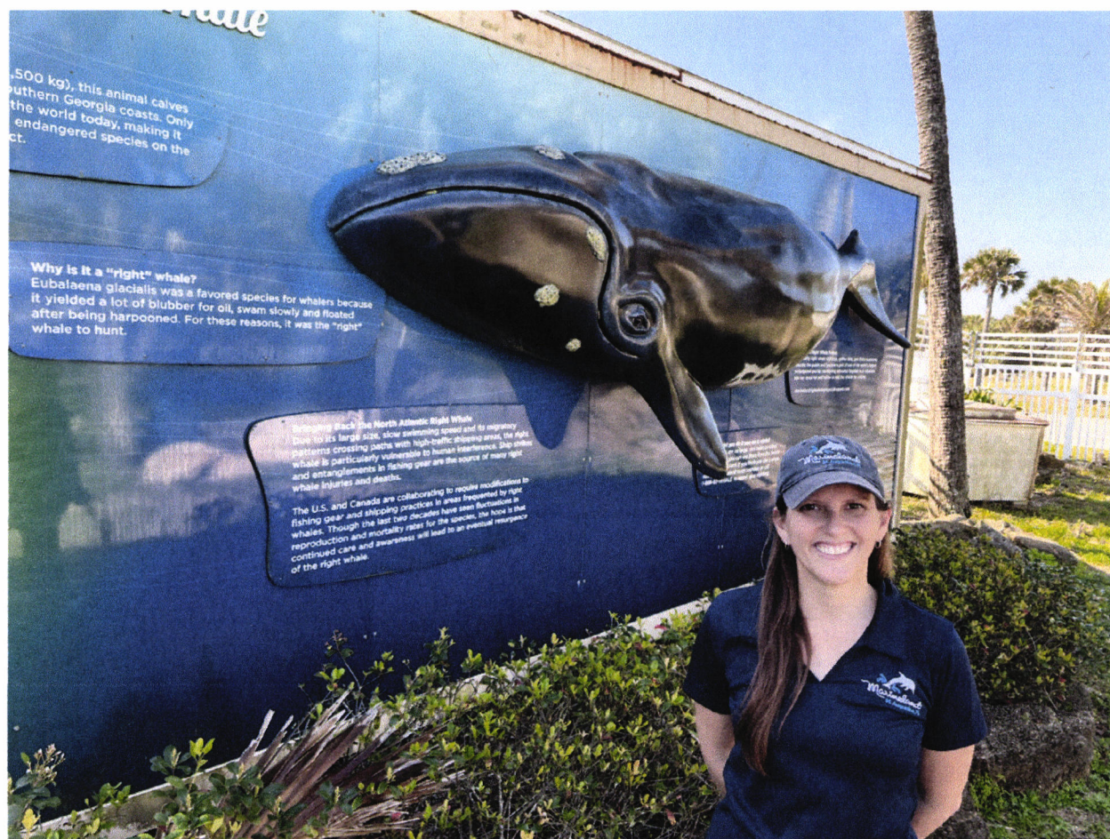
A right whale sculpture with informational panels is located at the south end of the park.