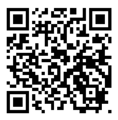
Exculpation, Release, and Injunction Provisions in the Plan

Copies of this notice, the Solicitation Order, the Combined DS and Plan, and all other documents publicly filed in the Chapter 11 Cases can be obtained free of charge by visiting the Debtors' Case Information Website (https://www.veritaglobal.net/fisker), or by accessing the link at the following QR code: